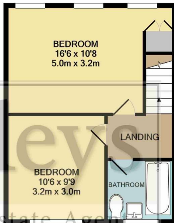
1ST FLOOR APPROX. FLOOR AREA 347 SQ.FT. (32.3 SQ.M.)

TOTAL APPROX. FLOOR AREA 695 SQ.FT. (64.6 SQ.M.)